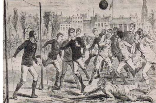
England v Scotland at the Oval the year after Ipswich amateur club was formed