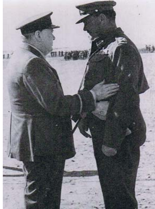
Caption: Churchill has a private word with Freyberg. February 1943.

'It would give me much pleasure to include your name in the list of recommendations which I shall submit to the King for the Birthday Honours. I have it in mind to recommend that the dignity of a Barony of the United Kingdom be conferred upon you, and I hope you will allow me to do so. When Mr Holland was over here in January, I took the opportunity of mentioning this proposal to him and he warmly concurred. Perhaps you will be so good as to let me have your reply by telegram.'