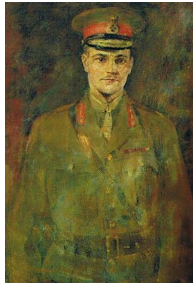
Caption: Freyberg V.C. 1918 One of the youngest brigadier-generals in the British Army. Portrait by Ambrose McEvoy.

His V.C. was awarded 'For most conspicuous bravery and brilliant leading as a Battalion Commander.' The action in which it was won is described by General Sir Beauvoir de Lisle: