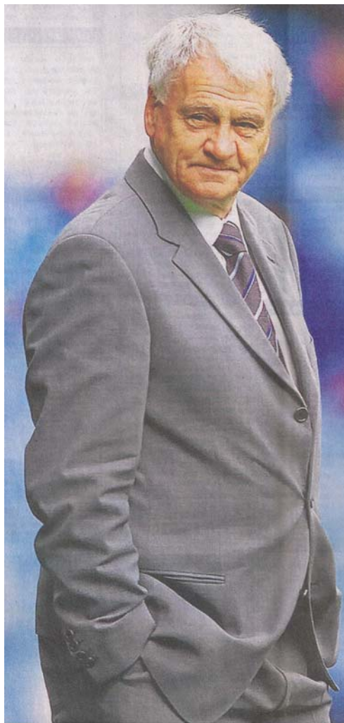
Caption: Robson: his record as England manager is surpassed only by Ramsey’s

“Vindication of the conviction that he was equipped to be an outstanding manager came in a prolonged flood over more than a dozen years at Ipswich, where the FA Cup and the Uefa Cup were won and the provincial team’s supporters were thrilled by league form that twice earned the runners-up place in the top division”.