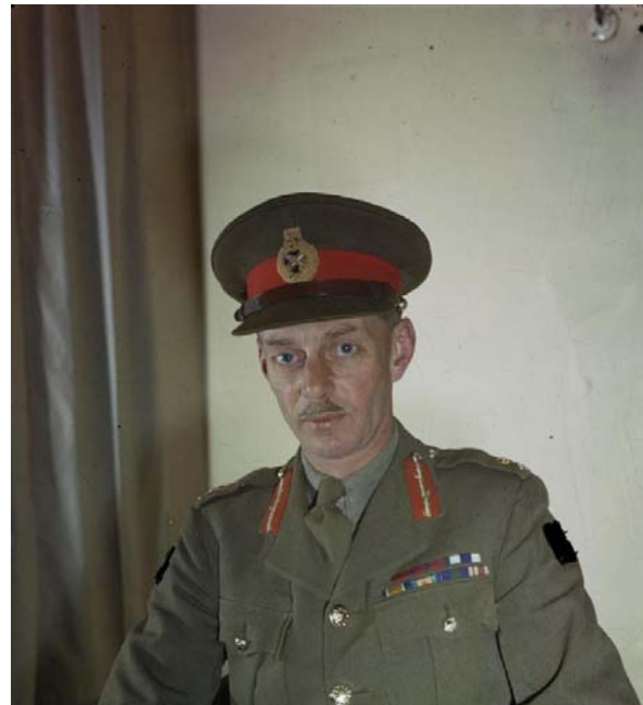
Lt. Gen. Miles Christopher Dempsey

The Second Army was the main British force (although it also included Canadian Army units) involved in the D-Day landings, making successful assaults on Gold, Juno and Sword beaches on 6 th June 1944. Second Army made a rapid advance across France into Belgium, liberating Brussels and Antwerp in September. On 15 th October 1944, during a visit to the Second Army, King George VI knighted Dempsey on the battlefield. It is thought he is the last person to have been so honoured by an English King on the battlefield. Because of the fast and successful advance of more than 200 miles in a week Dempsey got the nickname "Two Hundred Miles" Dempsey.