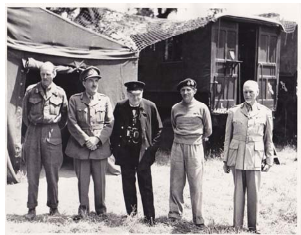
Gen. Dempsey with Churchill, Alan Brooke, Montgomery and Smuts