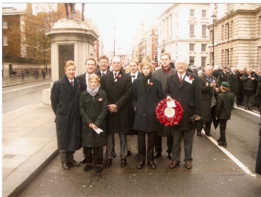
9 Cobbolds march to Cenotaph, 11 th November 2007