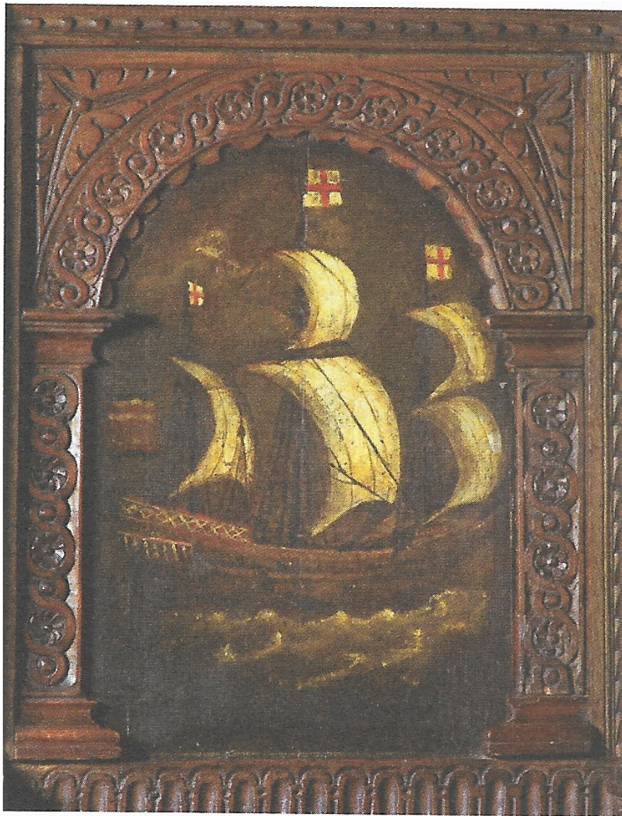
Detail from the Eldred Overmantel.