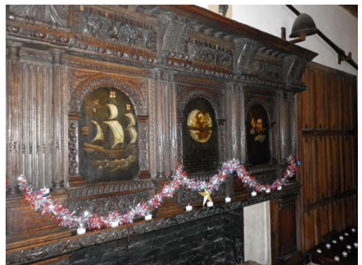
The Eldred Overmantel (dressed for Christmas)