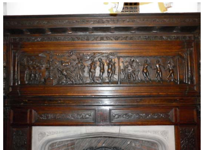
The Wingfield Overmantel