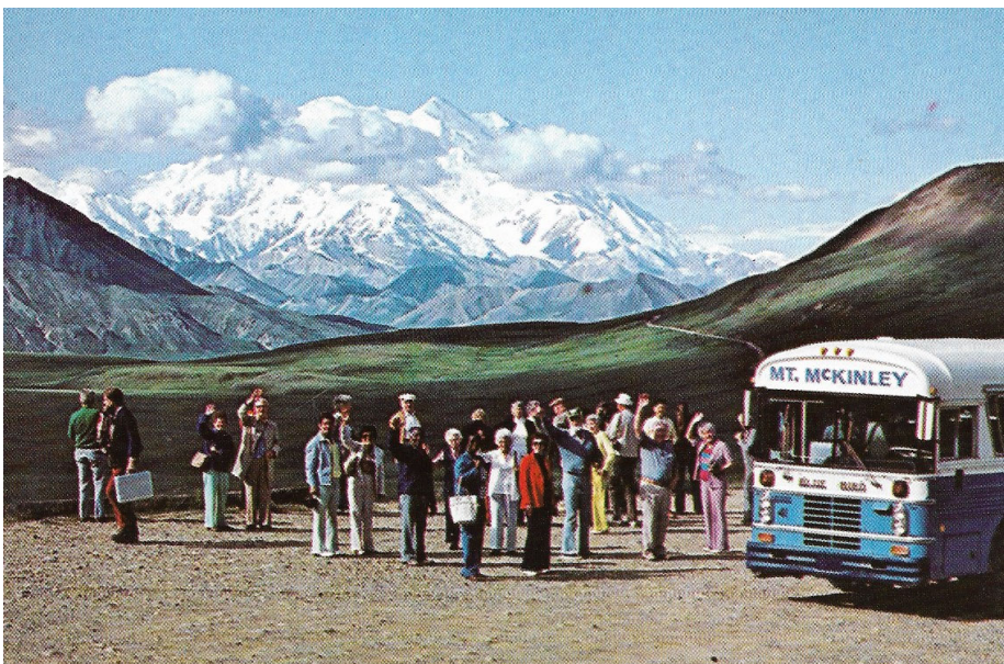
His post card picture of Mount McKinley