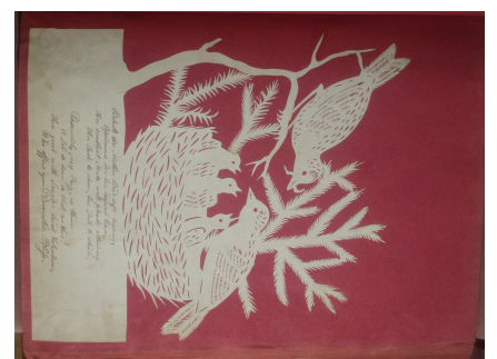
The Mother Bird