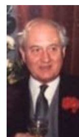
Sir Reginald Louis Secondè