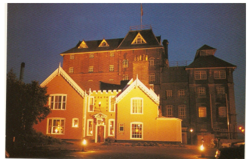
The Cliff Brewery